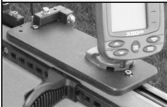
Sideboard shown with fishfinder head and deployed Transducer Deployment Arm (TDA is Patent Pending).

The Side Board mounts directly onto the Wilderness Systems SlideTrax system and provides additional accessory mounting space, without having to drill holes in your kayak.