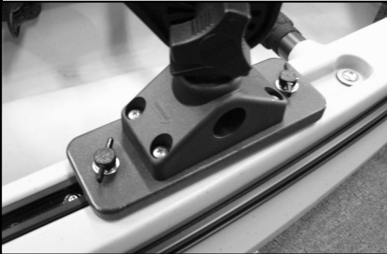
Sideboard Mini shown with Scotty Baitcaster

The Sideboard Mini mounts directly onto the Wilderness Systems SlideTrax system and provides accessory mounting space, without having to drill holes in your kayak.